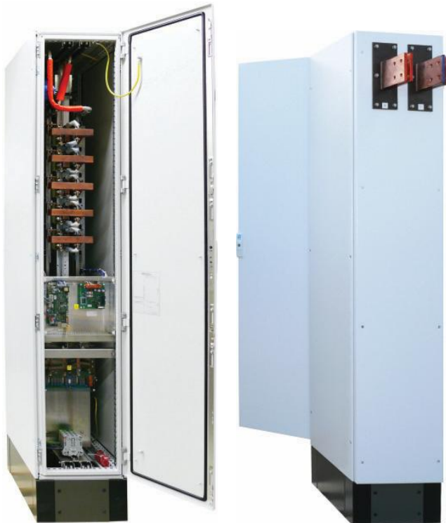
POWER STATION pe5410-W, front and back view

Mains supply: standard 3 x 400 V +/- 10 % / 50-60 Hz (other voltages on request)