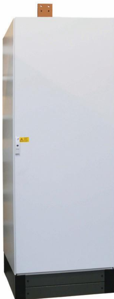
POWER STATION pe5710-W, front view – example

Water cooled DC power supply in switch mode technology, designed for the direct installation at the electroplating tank with minimized floor space.